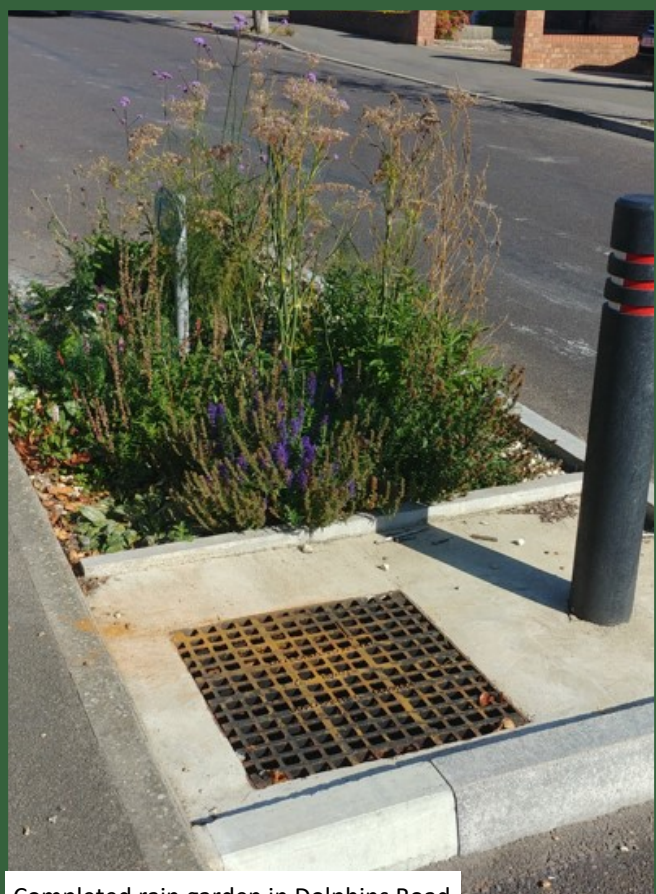
Completed rain garden in Dolphins Road

The rain gardens have proven successful and the frequency of flooding has reduced.