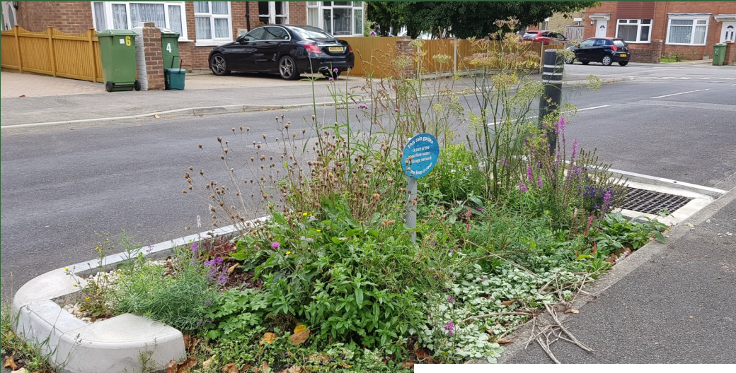
Completed rain garden in Dolphins Road

As it was not realistic to upgrade the existing sewer network, rain gardens were designed for installation on Dolphins Road and Wingate Road to reduce the highway water runoff.