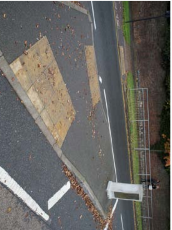
Traffic island – lets you cross in two stages.