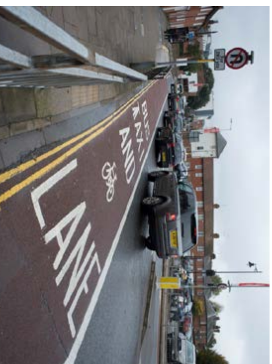
Traffic island – beware faster moving buses in the bus lane.