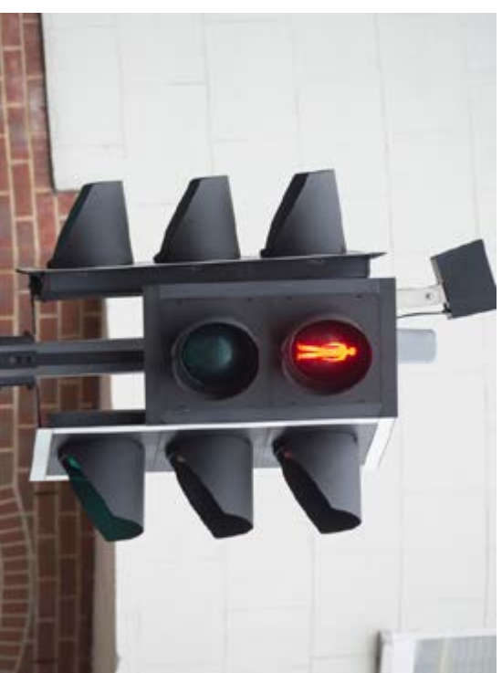
Pelican crossing – green means cross only when the traffic has stopped.