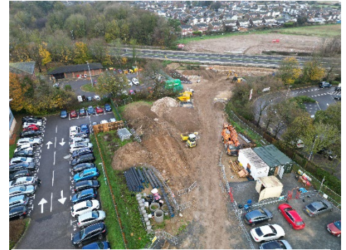
Aerial Footage of Section 1

In 2022, we began our work on Dover Fastrack by creating new entrances and clearing vegetation to give us access to the site. We started the work for the new bridge in Section 1 by installing drainage, including 4000 band drains. In order for us to complete the works across site, we have had to move several utilities, including along the verge of the A2. We also began piling in Section 1A south, including an initial test pile and further 5 piles. This will provide the new bridge with strength and stability.