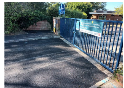
Resurfaced road outside Guston Primary school

During the summer, we worked with two local community projects. The first was at Guston Primary school where we resurfaced the entrance to the school, and the second was at St Radigund’s Community Centre where we are helping to make their outside area usable through vegetation clearance.