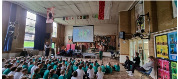
Visit to Green Park Primary

Starting in October, we visited local primary schools including, Langdon, Green Park and White Cliffs. We have delivered workshops called 'Be Safe, Be Seen' and 'What's Under Our Feet'. The first is aimed at key stage one and teaches children the importance of visibility when travelling to and from school. We have also provided the schools with reflective zip tags to help the children be seen. The second is aimed at key stage two and gives children an insight into underground services and how we find them on a construction site. It also gives them an understanding of the variety of jobs that we do on a site like Dover Fastrack while also showing them how they can stay safe if they see warning signs for underground services.