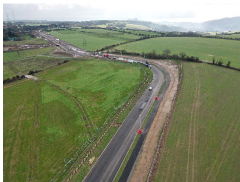
Aerial footage of Section 2

In Section 2, we created a new stretch of road between the B&Q roundabout and Dover Road, that was accompanied by street lighting, and this will continue into 2023.