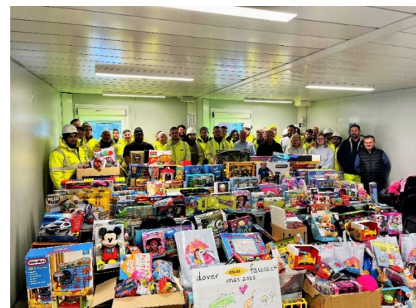
Colas employees with the donated presents

During December, we collected Christmas presents and food for local families. We chose to support Dover Pantry through food donations, and Buckland and Whitfield Children's Centre and Kent Young Carers through children's Christmas presents. We also raised money for Save the Children's by taking part in their national Christmas Jumper Day.