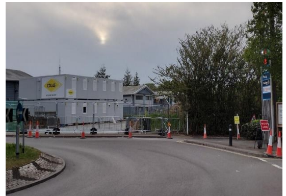
Colas Site Compound Office

The Colas site compound is constructed in Section 1B South, adjacent to the Tesco roundabout. The site compound building will be in place until Summer/Autumn 2023. Groundwork continues in this section which includes surveys and drainage, progressing towards creating an entrance to 1B North.