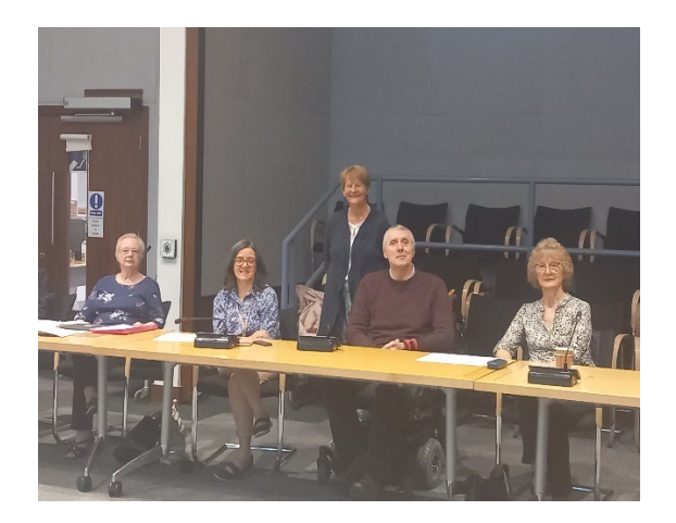
some committee members of the Gravesham Access Group

Earlier in June, we attended a committee meeting of the Gravesham Access Group in the Gravesham Borough Council Chambers. The purpose of the meeting was to carry the group along with the project and inform them of changes to expect. We are still in talks to ascertain what contributions we can make that will be impactful to the group and the entire community.