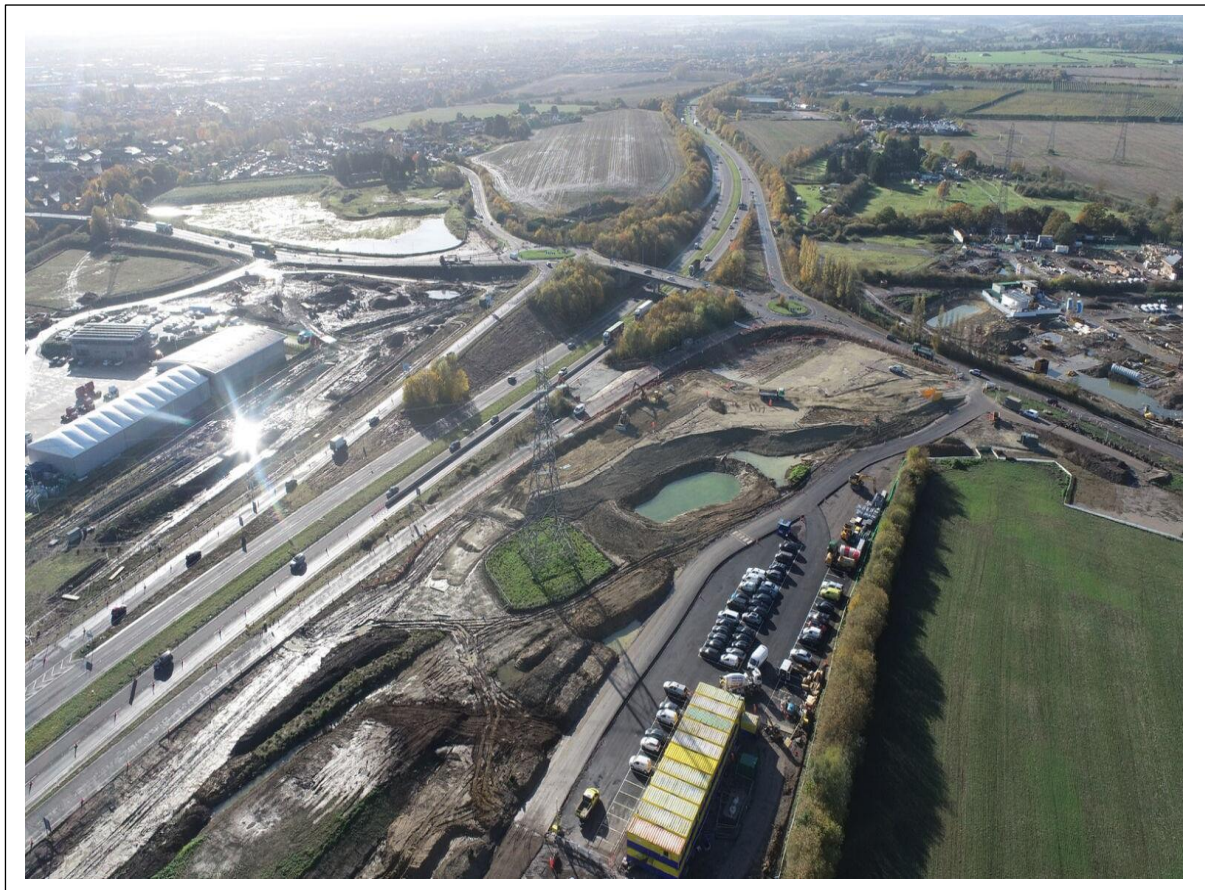
(Drone image showing works in progress and the newly erected Jackson Site Offices, closer to site of the A249 Grovehurst Road Improvement Scheme)