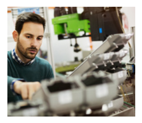
Employment costs of new permanent employees (this does not apply to existing staff).

Applicants will need to specify in their business plan how the proposed investment will enable their business to grow, address weaknesses, protect or create jobs in Kent and Medway, and adapt to the changing markets in which they operate through innovation, increasing capacity, improving productivity and/or developing new or expanding existing products. Applicants must also demonstrate their commitment to net carbon zero and be prepared to give examples of existing supply chains within and outside Kent and Medway.