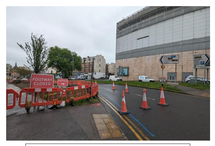
Photo 1: In the first photo you can see the area closed off along Foresters Way with a pedestrian diversion sign pointing you in the direction of Asda.