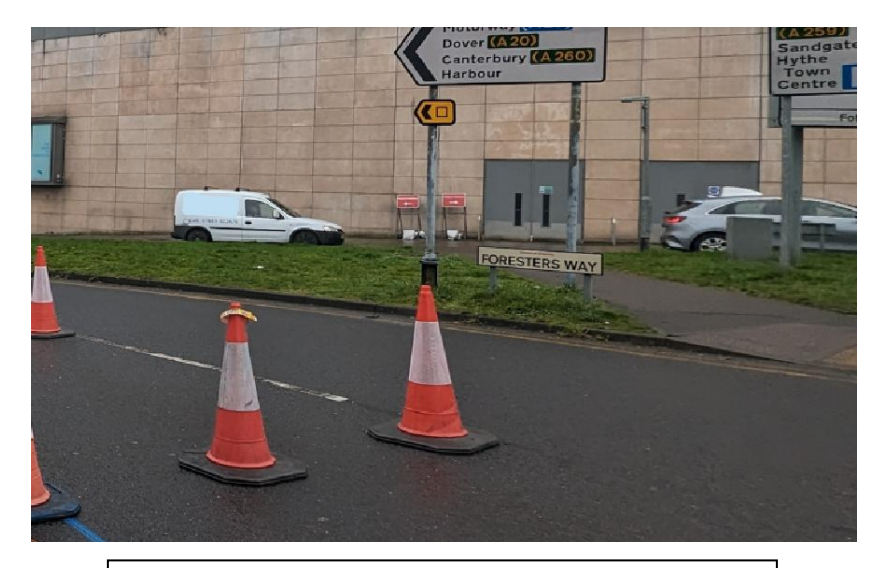
Photo 2: In the second photo you can see a further 2 signs that will direct you towards the bus station, and down towards Lidl.