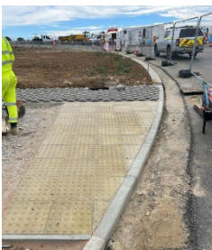
Installation of Tactile Paving with Pedestrian deterrent paving

Drainage works, kerbs and footpaths continue to be installed including the addition of tactile paving. Tarmac surfacing has been carried out on large sections of the footpaths.