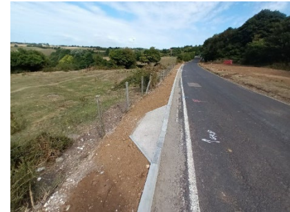
Dover Road, Phase 1 works crossing

Works on Section 3, Phase 1 finished on 20 August 2022. A re-visit with additional road closure will be required once SGN & Severn Trent Water have programmed in the necessary utility diversions. This will then enable completion of road widening works adjacent to Guston Primary School and the construction of the new bus layby at Burgoyne Heights.