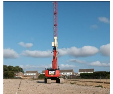
Band drain installation

Dust suppression measures are being undertaken to minimise the potential for dust nuisance.