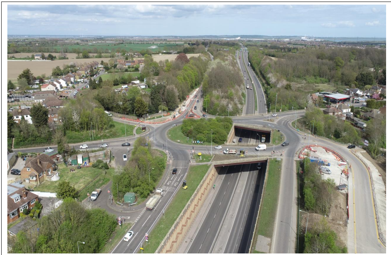
Aerial view of Key Street roundabout