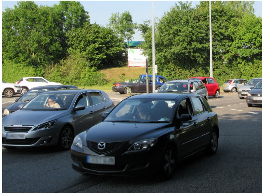
Traffic at the Bearsted Road roundabout

There will be times when temporary traffic signals are required, particularly where drainage and utility ducts need to cross existing traffic lanes, or at tie-in points. These will be kept to a minimum wherever possible.