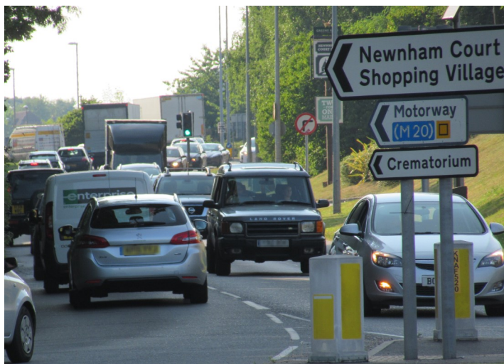
Traffic on Bearsted Road looking west

This improvement scheme aims to ease congestion, reduce idling traffic, improve traffic flow and accommodate increased trips associated with the growth at the Kent Medical Campus, Eclipse Park and developments in the town centre and south Maidstone. The increased capacity will also make it easier to carry out future routine maintenance with significantly less disruption to the travelling public.