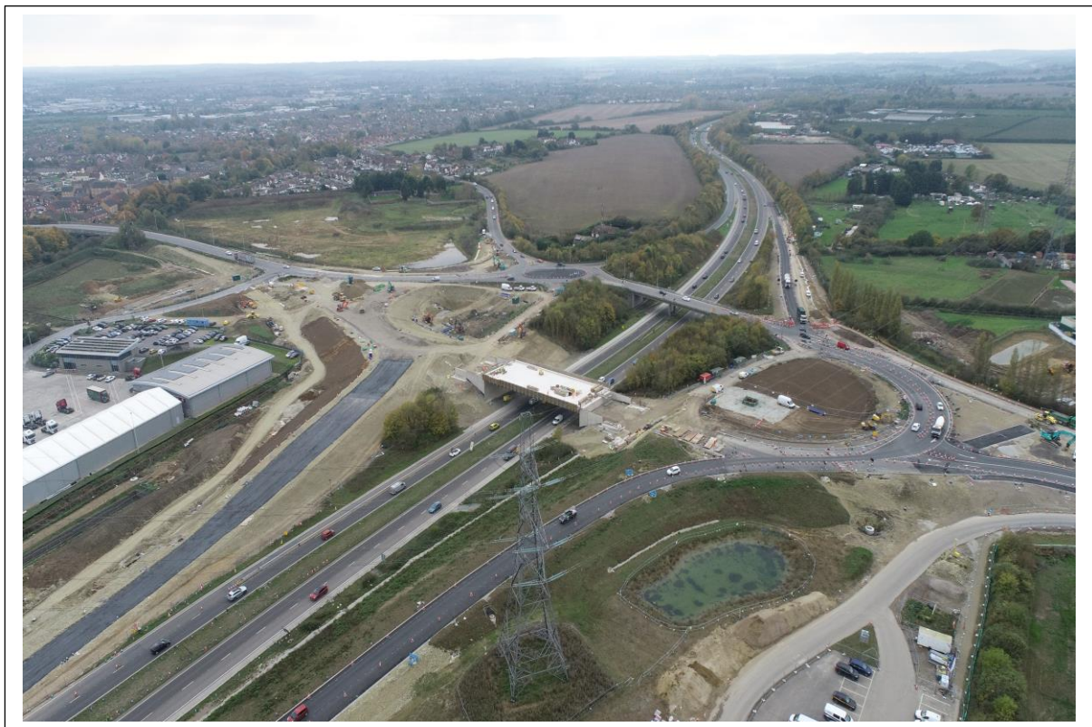
Southbound exit slip road under construction