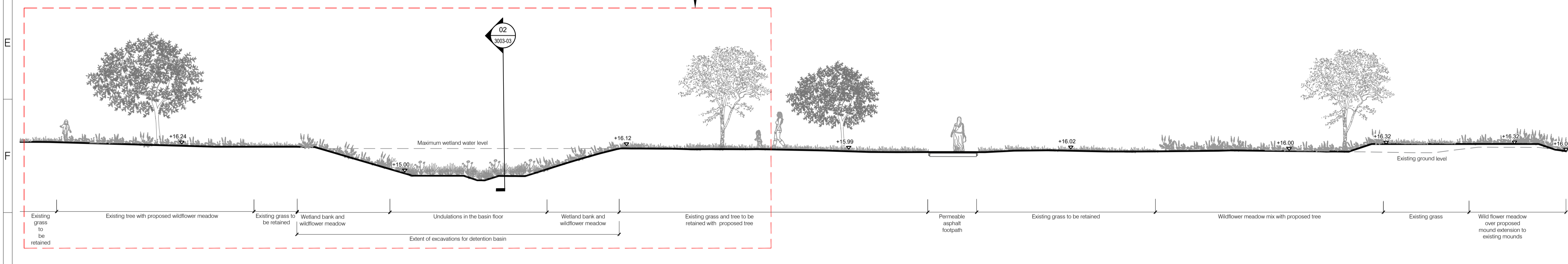
02 WETLAND BASIN CROSS SECTION 3003-01 SECTION N.T.S