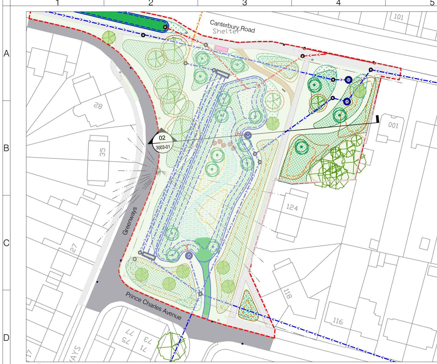
01 Location Plan 3003-01 SECTION NTS