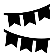
Chart Sutton Parish Council held a Big Jubilee Lunch on 5th June 2022, in celebration of the Queen's Platinum Jubilee. Designed to bring the community together to celebrate a momentous event and also an opportunity to come together once again following the COVID-19 pandemic. Member Grant funding provided portable toilet hire, marquee hire, food and table and chairs.