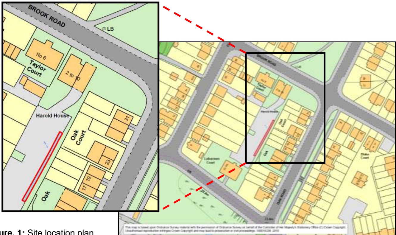
Figure. 1: Site location plan