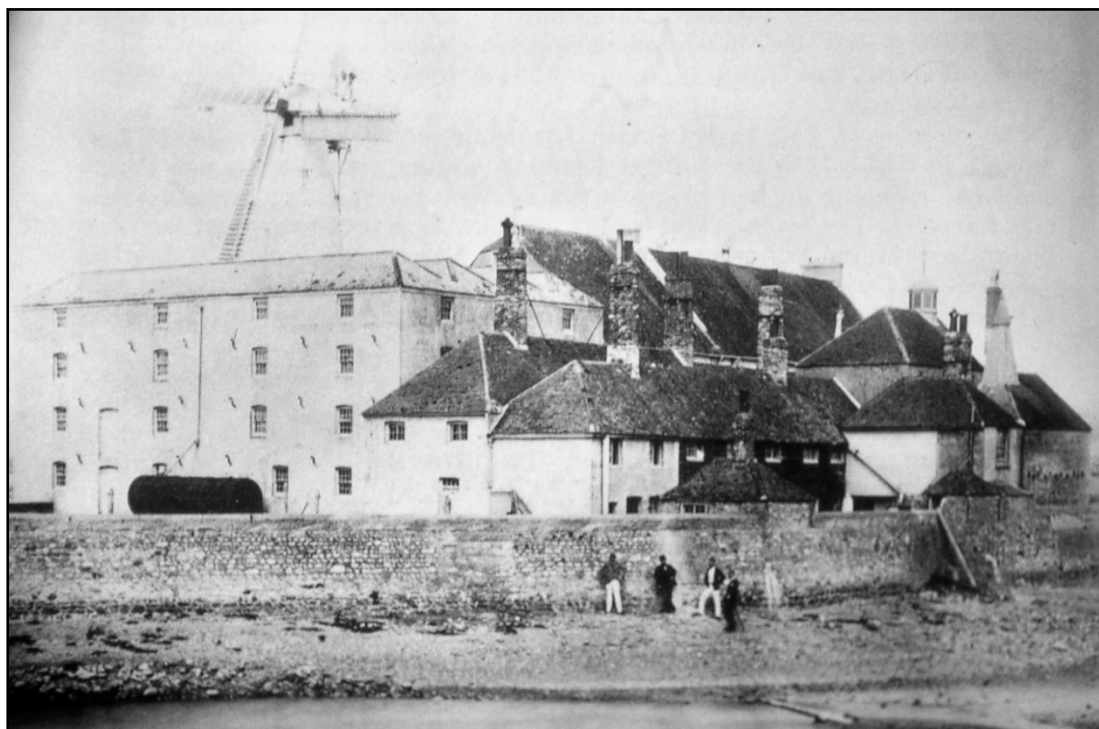
Figure 3. View of the mill complex at Bishopstone Tidemills in 1883

Birdham and Emsworth. Most of these date to the 18th century and a few such as Emsworth still remain though now converted for other use. The only mill to receive archaeological attention is that of Bishopstone Tidemills between Newhaven and Seaford (McCarthy and McCarthy 1975; Farrant 1975; Longstaff-Tyrrell 1996) and is currently the focus of a community archaeological project run by the Sussex Archaeological Society.