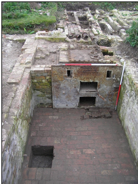
Figure 2. The excavated stoke pit and c. 1840s boiler for the large heated greenhouse at Bishopstone Tidemills, East Sussex

To date little archaeological work on the gardens of the region has been undertaken though what has been done has ranged from the larger gardens (Aldsworth 1980; Tatton-Brown 2002; Taylor 2003) to much smaller examples such as those at Ore Place (Gardiner 1991). In addition gardens and parks are also associated with ancillary structures ranging from drainage/irrigation systems, fountains, greenhouses of varying size and complexity (Fig. 2), cold frames, hot beds, toolsheds and a number are also graced with follies of various forms and features for enjoyment such as prospect mounds and summer/banqueting houses (Aldsworth 1983a).