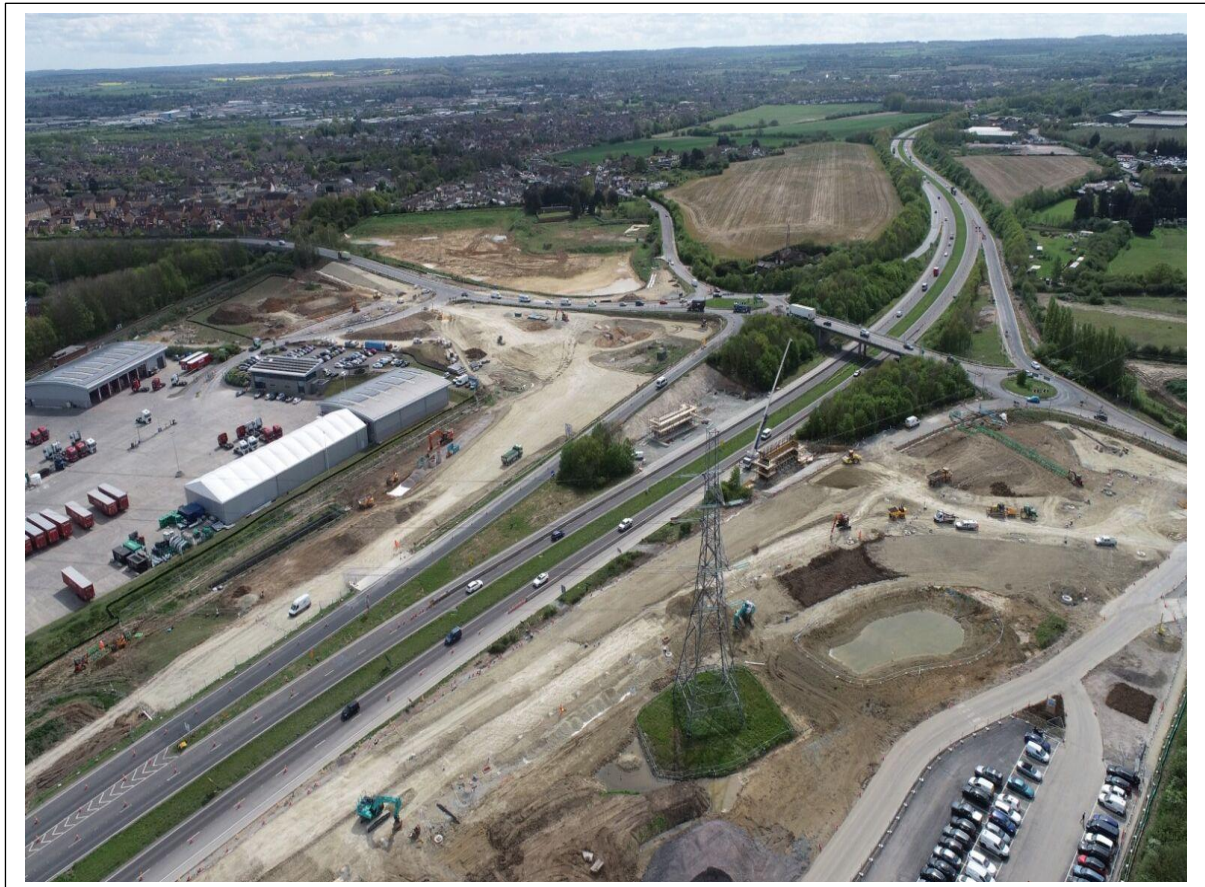
Aerial view of structure for the new bridge, and the new northbound entry slip under construction.