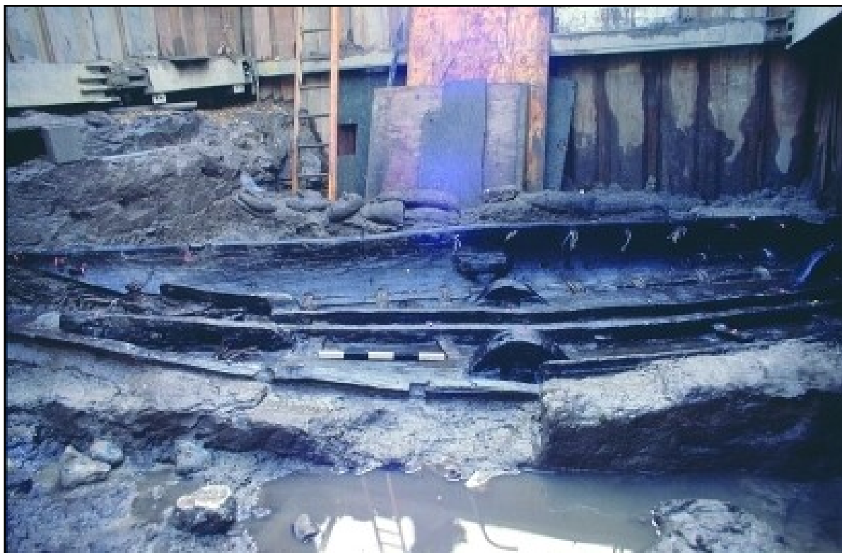
Figure 1 The Dover Bronze Age boat under excavation. Kent County Council