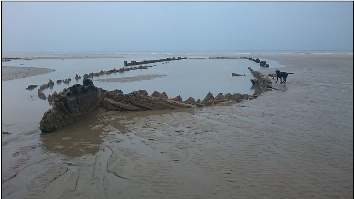
Figure 2. Wreck of the 'VOC Amsterdam', East Sussex