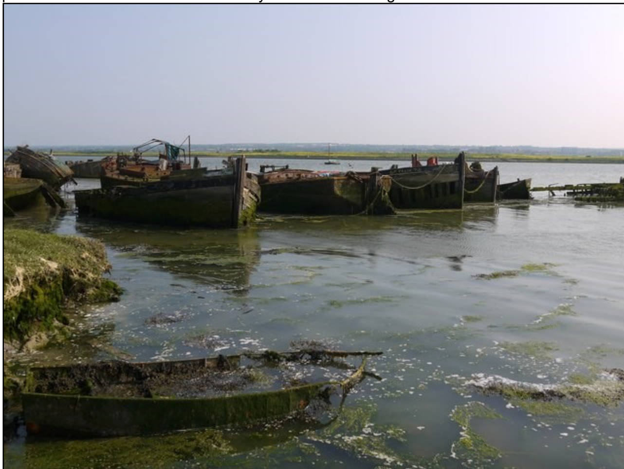
Figure 3 Barge hulks at Hoo Saltings

ports involved with the industry have surviving features such as the