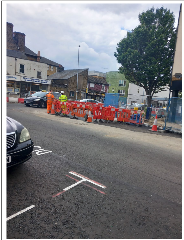
Bath Street – BT Chamber now completed!