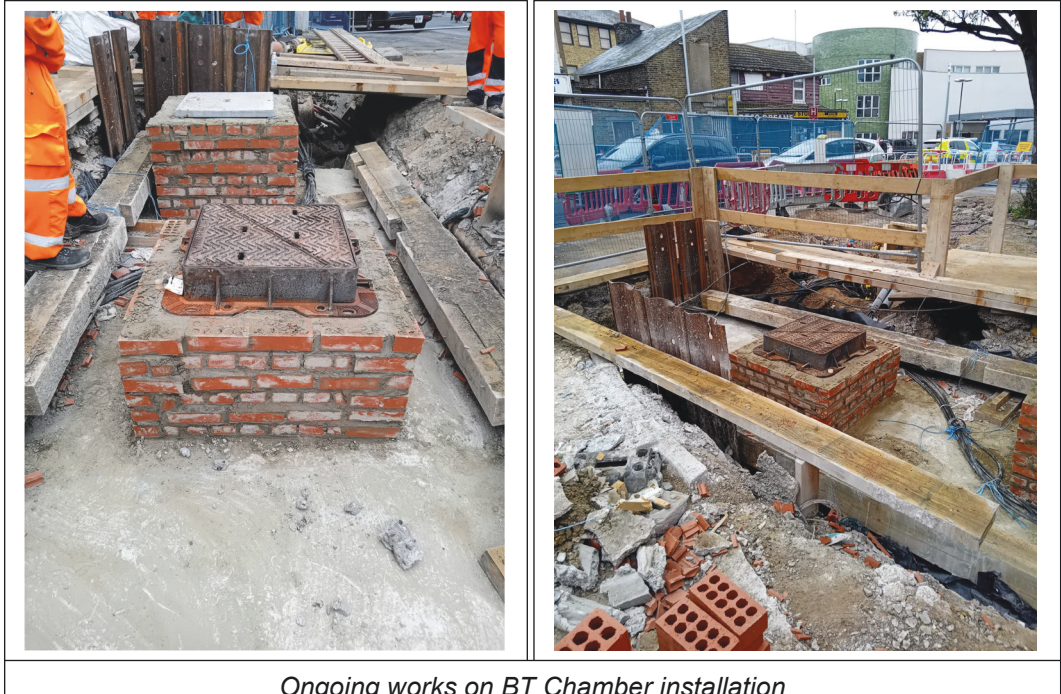
Ongoing works on BT Chamber installation