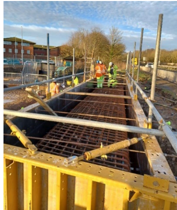
Reinforcement and Formwork

In section 1b South we have started building the bridge abutment, breaking down the concrete piles and installing the steel reinforcement so that we can install the concrete. We have also been working along the verge of the A2, backfilling the services and putting in a concrete protection slab, to improve access to site.