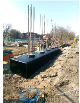
Protective coating added