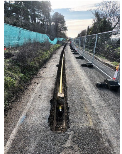
SGN Gas Works

These utility works will continue into February.