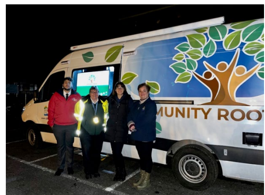
Dover District Council

On the 27 th of January we partnered with the Dover District Council in their new Community Roots Van to help young people riding on bikes and scooters without visibility lights. Our aim was to help the community wardens and social workers to educate these young people about the dangers that they were placing themselves in and Colas also provided bike lights and spoke reflectors to give to the young people.