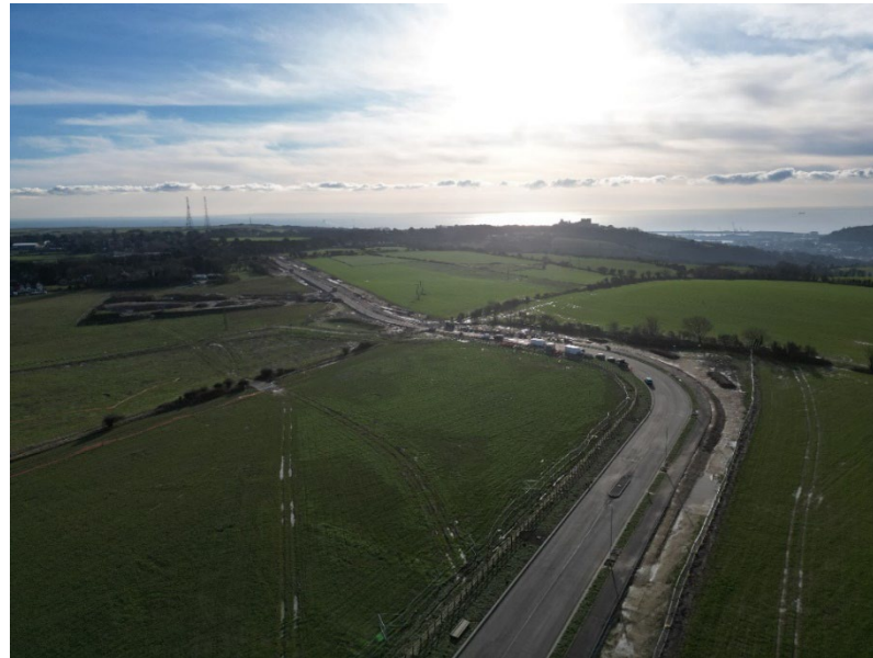
Looking across Section 2 - January 2023