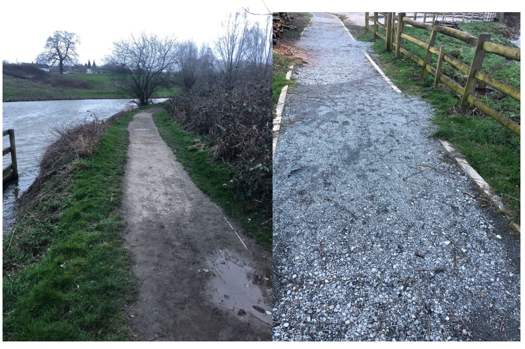
Co-financed by the European Union European Regional Development Fund