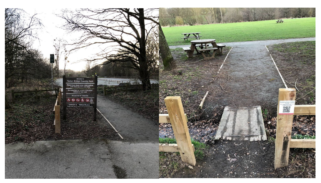
Co-financed by the European Union European Regional Development Fund