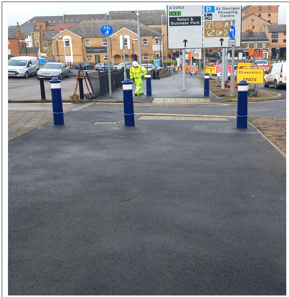
Surfacing works on footpath completed.