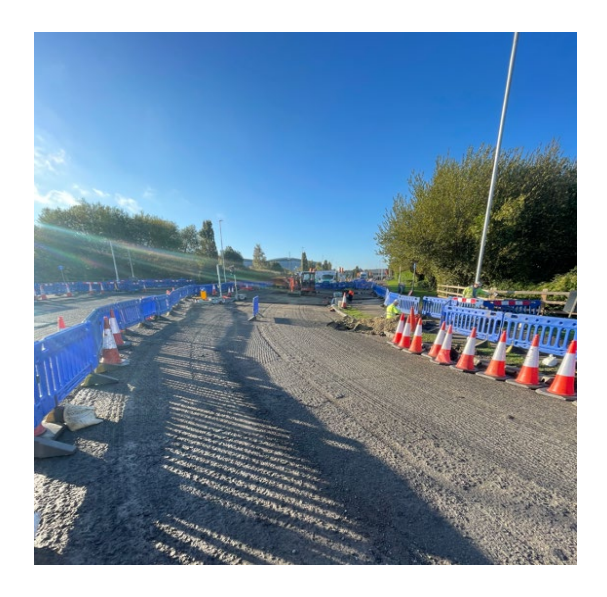
Carriageway milling within phase 6.