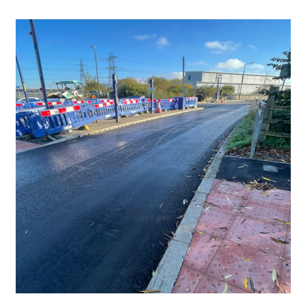
Photo of the outbound approach of the Kent Fastway which has recently be resurfaced.