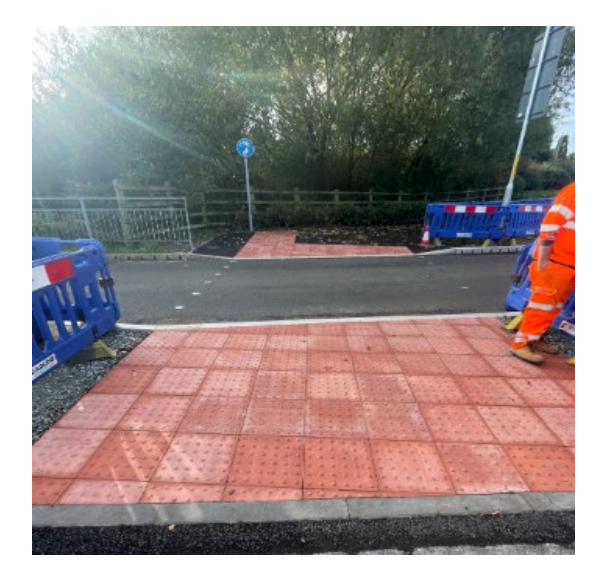
New tactile paving that has been laid across Kent Fastway pedestrian crossing point.