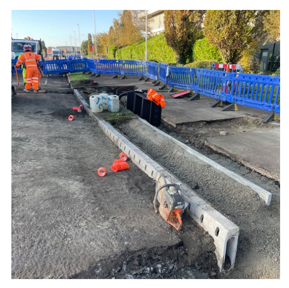
New Aco-Kerb drains that have been . Installed within phase 6.