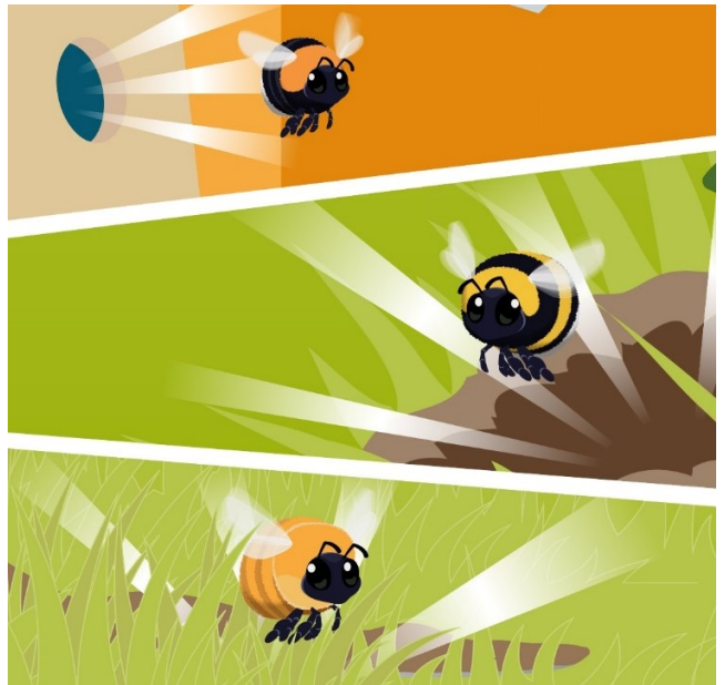
Help bumblebees by providing boxes, messy untouched patches, and long grass.