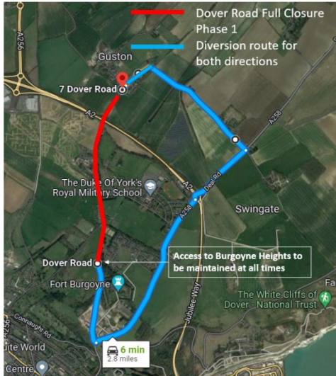
Figure 1: Dover Road Phase 1 Traffic Management