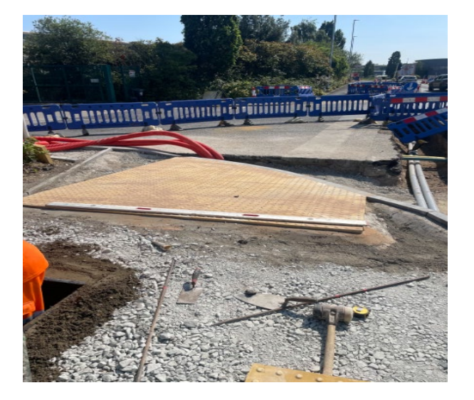
Tactiles laid for the uncontrolled crossing point