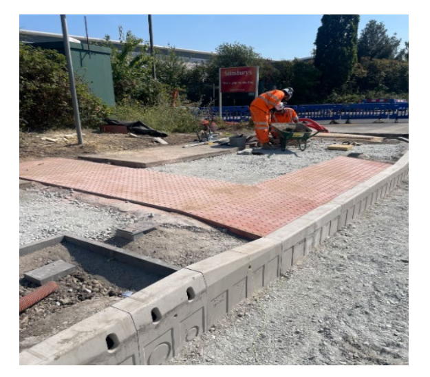
Tactiles laid for controlled pedestrian point