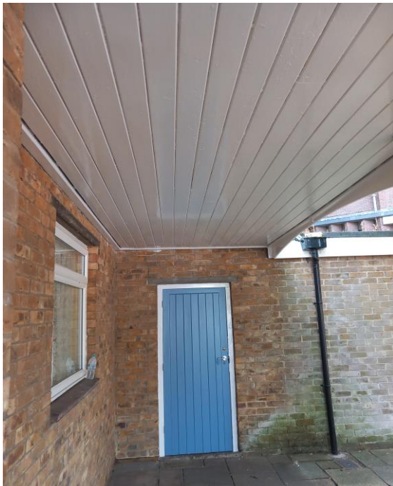
What it looked like before...