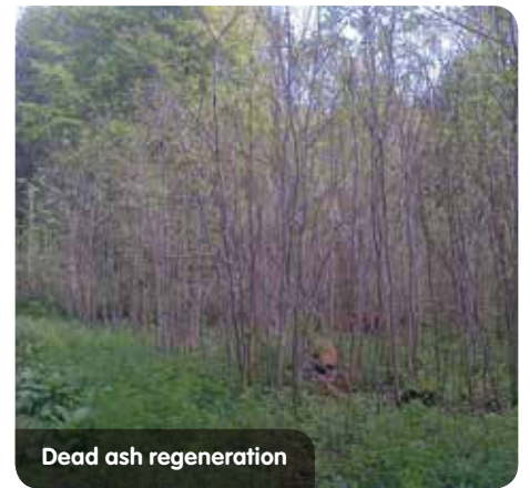
Dead ash regeneration