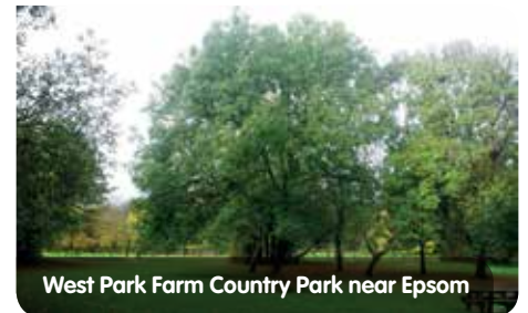
West Park Farm Country Park near Epsom

Trees, woodlands and forests are a precious national asset which offers extensive social, economic and environmental benefits. We must safeguard this asset from threats such as climate change, pests and diseases. This means that the range and diversity of tree species in our urban forest and