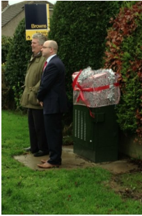
First cabinet live launch in Densale, Kent, December 2013.

BT Openreach are making upgraded cabinets available to ISPs as soon as they are ready for service.