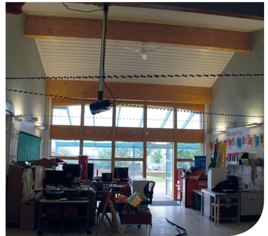
The photo above was taken before LED Installation