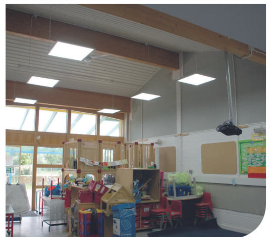
After LED Installation