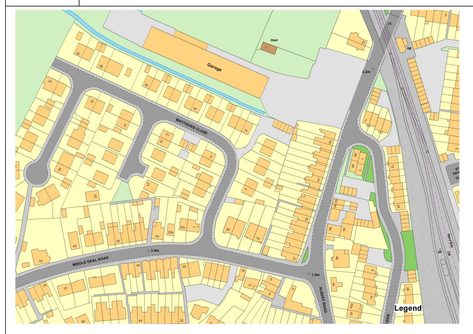
Figure 1 Location plan