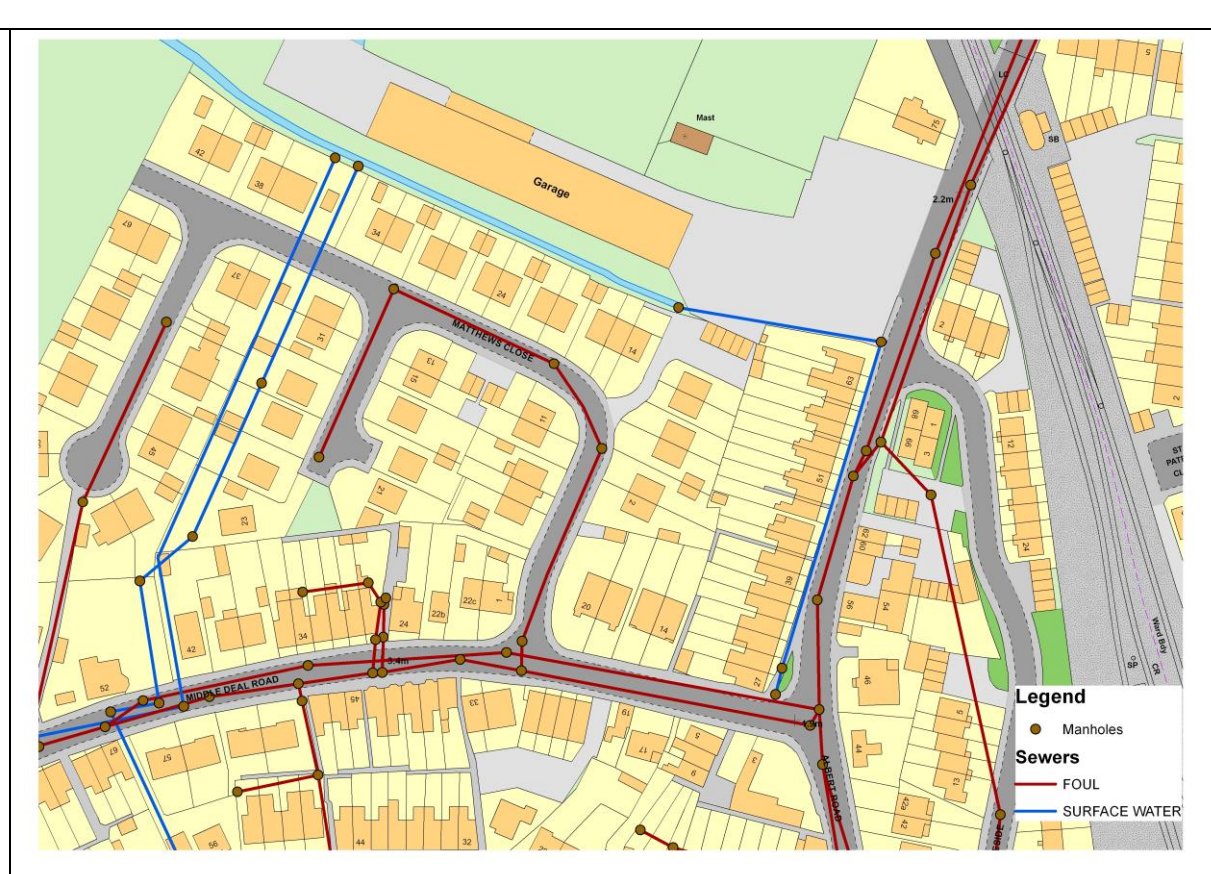
Figure 3 Albert Road sewers

An unexpected electrical fault at the Golf Road pumping station resulted in the foul sewers backing up with the rainwater that was entering them and surcharging. Albert Road is the low point on the ground along these sewers and the excess water discharged there.