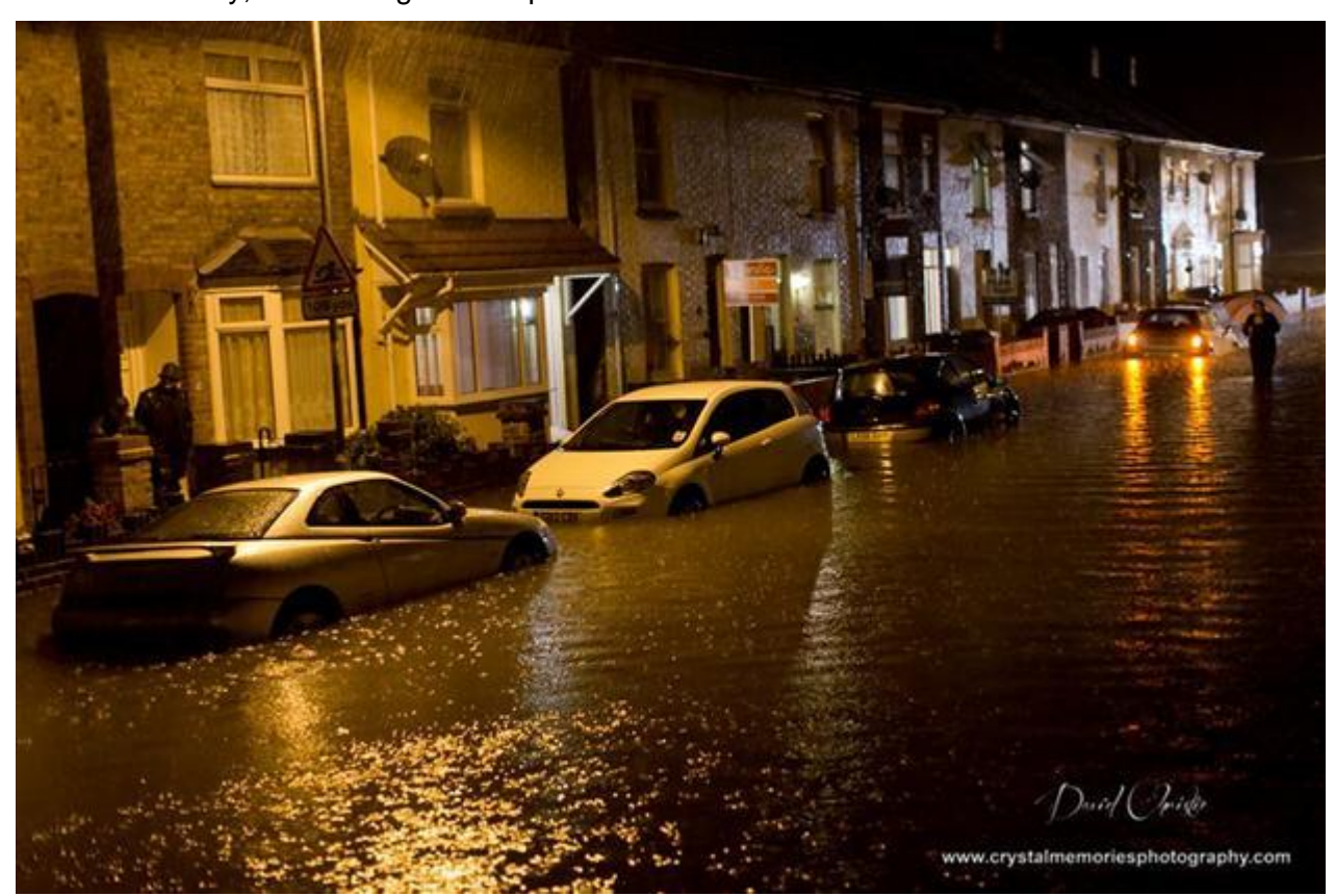
Figure 2 Flooding at Albert Road on 21 May 2014

The flooding followed a period of heavy rainfall and resulted in damage to properties on Albert Road and flooding on the road, estimated to be approximately 30cm deep. 22 properties were flooded internally, and damage was reported to vehicles.