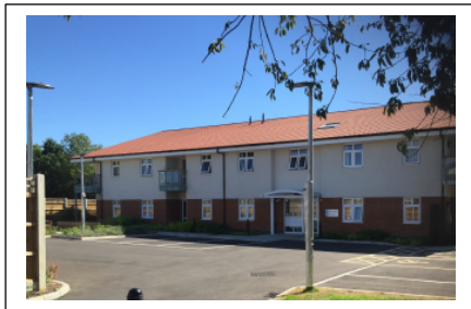
Adjacent Supported Housing Scheme