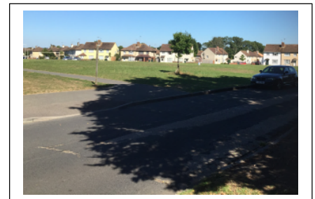
Adjacent Public Open Space