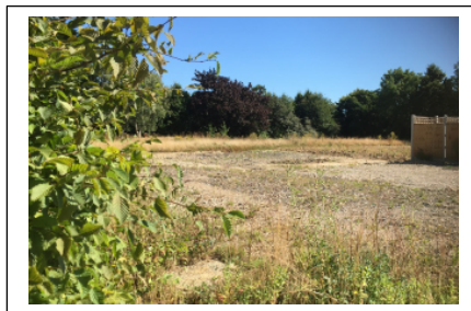
View Across Development Site